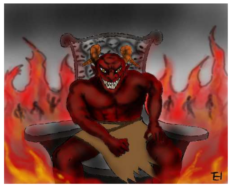
There is a cost for sin!

Juan 3:36 Diospaj Churita maijambash crij cashpaca, causaita causagrinatami charin. Ashtahuangarin Diospaj Churita na cazungapaj munashpaca, causaita causagrinataca napacha charingachu. Ashtahuangarin ninanda fiñashpa Taita Dios Ilaquichinaca, paipaj jahuapimi shuyajun— nijurcami.