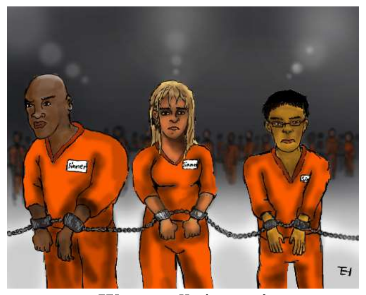
We are all sinners!

Tucuicuna juchata rurashcamandami, Taita Diospaj punchapambagumanda anchuchi tucushca causanajun.